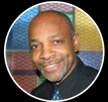
JOHN PAUL JONES